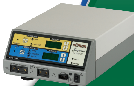
Surgitron® Dual RF™